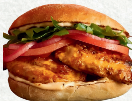
Peri Peri Chicken Burger 12.90

Beef patty, cheese, lettuce, tomato, and onion