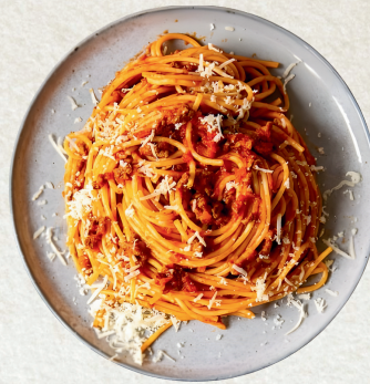
Spaghetti Bolognese 25.90

Chicken cooked in rich creamy basil pesto sauce, parmesan cheese, cherry tomato, olive oil, fresh herbs, with penne pasta.