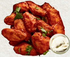
Buffalo Wings 15.90

Marinated chicken wings tossed in spicy buffalo sauce served with tangy ranch sauce