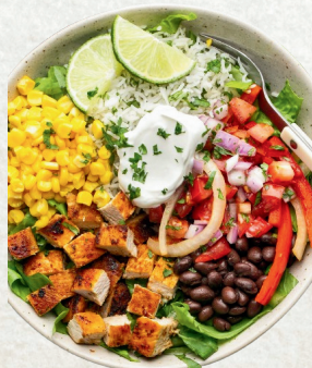
Chicken Over Rice Platter 20.90

Marinated grilled chicken, mixed beans, tomato salsa, creamy white garlic sauce over aromatic saffron rice.