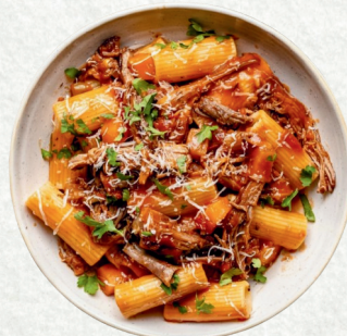
Beef Ragu Rigatoni 28.90

Potato gnocchi, creamy pink sauce, fresh basil pesto, parmesan cheese.