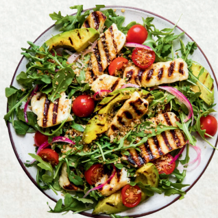
Grilled Halloumi salad ✓ 22.90

Marinated grilled chicken, lettuce, tomato, onion, shredded carrot, cucumber and Italian vinaigrette dressing.