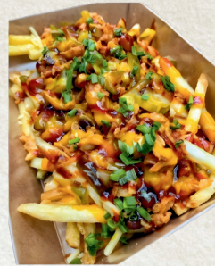
Veggie Loaded Fries 16.90 ✓

Crispy fries topped with slow-cooked beef mince, melted cheese, and jalapeno