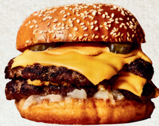
Double Double Burger 17.90

Beef patty, cheese, pickles, onion, grilled pineapple, fried egg, lettuce and tomato