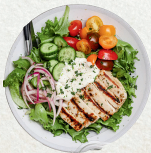
Grilled chicken salad 19.90

Marinated grilled chicken, lettuce, tomato, onion, shredded carrot, cucumber and Italian vinaigrette dressing.