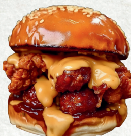
Korean Fried Chicken Burger 14.90

Slow cooked beef ribs, American cheese, slaw and smokey BBQ sauce