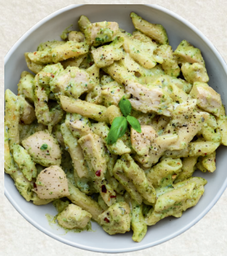
Chicken Penne Pesto 25.90

Chicken cooked in rich creamy basil pesto sauce, parmesan cheese, cherry tomato, olive oil, fresh herbs, with penne pasta.