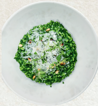
Lemon herb chicken 34.90

Chicken, lemon herb creamy sauce, garlic, parmesan cheese.