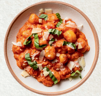
Gnocchi Parma Rosa 25.90

Slow cooked pulled beef, creamy truffle sauce, fresh herbs, parmesan cheese.