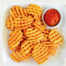
Waffle Fries 11.90