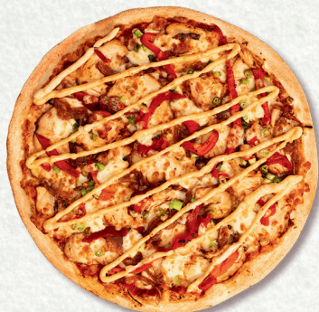
Peri Peri Chicken Pizza 21.90

Roasted capsicum, onion, mushroom, olive, oregano, mozzarella cheese and rocket.