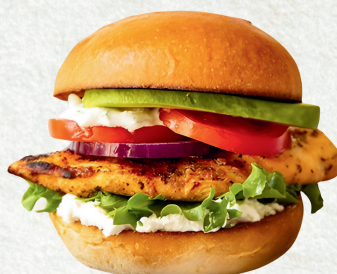
Grilled Chicken Burger 12.90

Korean fried chicken, Korean sauce, pickles, slaw