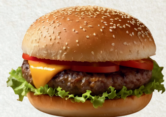
Classic Burger 12.90

Grilled and marinated chicken fillet, onion, mayo, lettuce and tomato