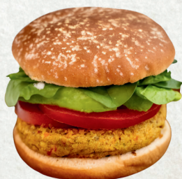
Monster veggie burger ✓ 14.90

Lamb patty, grilled onion, grilled halloumi cheese, lettuce, tomato and Smokey BBQ