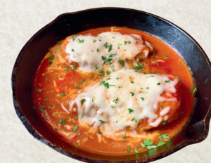
Chicken Alla Vodka 35.90

Veal slow cooked in rich tomato sauce, fresh Italian herbs, garlic, olive oil and vegetables served with creamy potato mash.