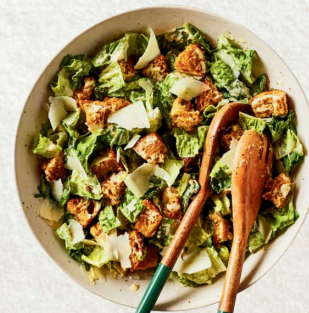
Caesar Salad 24.90

Grilled halloumi, lettuce, tomato, red onion, cucumber, carrot, apple with Italian vinaigrette dressing.