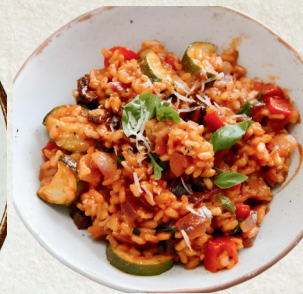
Veggie risotto 25.90

Fresh prawns, garlic, parsley, chili, napolitana sauce.