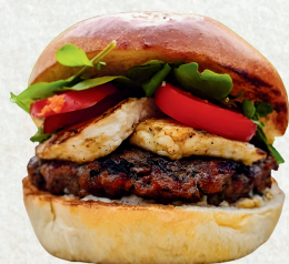
Lamb Burger 17.90

Buttermilk fried chicken, pickle, American cheese, lettuce, tomato and mayo