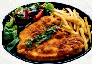
Chicken schnitzel 35.90

Slow-cooked beef ribs basted with homemade smoked BBQ sauce, served with a choice of chips or mashed potatoes.