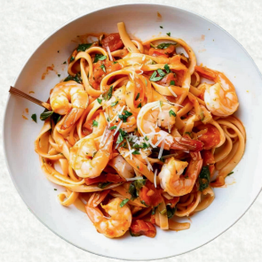
Truffle prawn linguine 29.90

Spinach and ricotta stuffed ravioli cooked with pesto, cream, parmesan cheese, and olive oil.