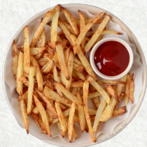
Crispy Fries 7.90