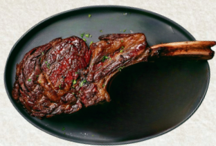
Tomahawk Steak 55.90

500g grass-fed tomahawk steak, served with a choice of chips or mashed potatoes.