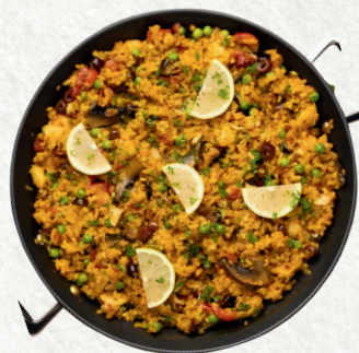
Veggie paella ✓ 29.90

Fresh fish, prawns, calamari, and mussels, cooked in a delicious saffron seafood broth.