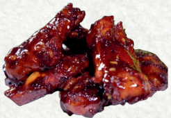
Smokey BBQ Wings 15.90

House battered fried chicken wings tossed in sweet spicy Korean sauce served with spicy garlic sauce