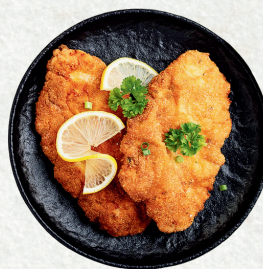
Veal cutlet 35.90

Slow-cooked lamb shank, cooked with fresh vegetables, herbs, oregano, garlic, and olive oil, served with mashed potatoes.