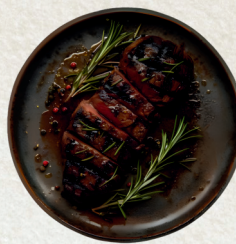
Sirloin Steak 39.90

500g grass-fed tomahawk steak, served with a choice of chips or mashed potatoes.