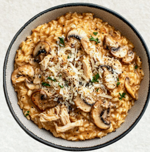
Chicken mushroom 25.90

Chicken, lemon herb creamy sauce, garlic, parmesan cheese.