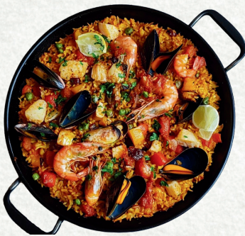
Seafood paella 35.90

Fresh fish, prawns, calamari, and mussels, cooked in a delicious saffron seafood broth.