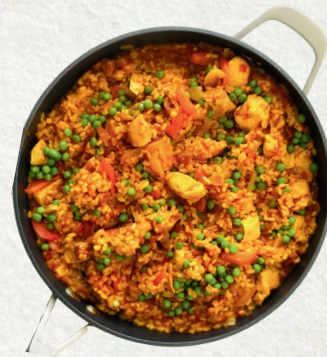
Chicken paella 30.90

Seasonal fresh vegetables, mixed beans, cooked with delicious saffron vegetable broth.