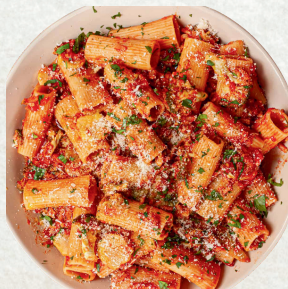
Rigatoni Amatriciana 25.90

Chicken, creamy mushroom sauce and marsala wine over linguine.