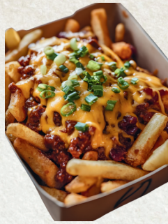
Beef Loaded Fries 16.90

Crispy fries topped with slow-cooked beef mince, melted cheese, and jalapeno