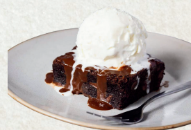
Chocolate brownie with ice cream 13.90