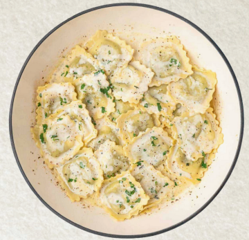
Spinach and Ricotta Ravioli ✓ 25.90

Slow-cooked beef mince, rich tomato sauce, fresh basil (no pork), parmesan cheese.