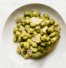
Gnocchi Pesto 25.90

Bacon, basil, parmesan cheese, napolitana, white wine.