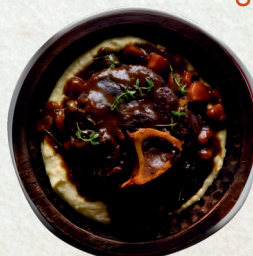
Osso Bucco 34.90

250g scotch fillet served with choice of chips or mashed potatoes.