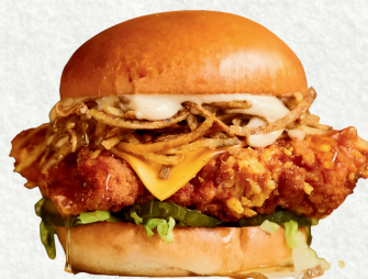
Truffle Chicken Burger 15.90

Chicken schnitzel, American cheese, coleslaw, homemade peri peri sauce