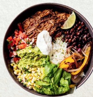
Beef Over Rice Platter 21.90

Marinated grilled chicken, mixed beans, tomato salsa, creamy white garlic sauce over aromatic saffron rice.