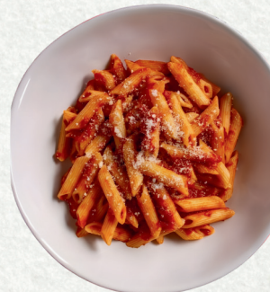
Chicken Arrabbiata 28.90

Slow cooked beef ragu, basil, tomato, parmesan cheese.