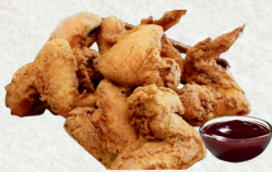
Southern Fried Wings 15.90

Marinated chicken wings tossed in spicy buffalo sauce served with tangy ranch sauce