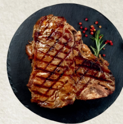
T-Bone Steak 45.90

250g sirloin steak, served with a choice of chips or mashed potatoes.