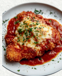
Chicken parmigiana 36.90

Chicken breast fillet coated with Japanese panko crumb, parmesan cheese, served with chips.