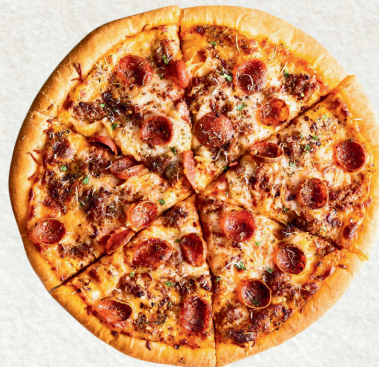
Meat lover's pizza 24.90

Napolitana sauce, mozzarella, fresh basil, cherry tomato and olive oil.