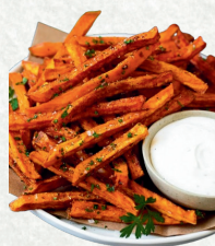
Sweet Potato Fries 11.90