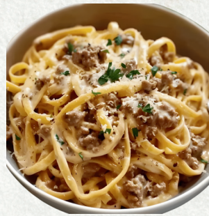
Beef and truffle linguine 28.90

Fresh prawn, cherry tomatoes, garlic, basil, oregano, parsley, creamy, parmesan cheese.