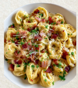
Tortellini Boscaiola 25.90

Potato gnocchi, pesto cream sauce, fresh basil, parmesan cheese.