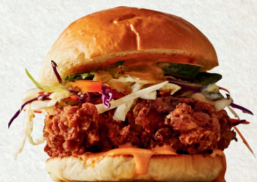
Southern Fried Chicken Burger 12.90

Marinated Fried Chicken, Cheese, Truffle mayonnaise, lettuce, tomato