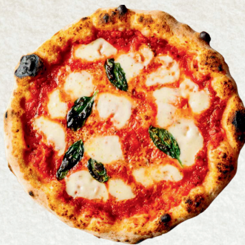
Margherita pizza 17.90

Napolitana sauce, mozzarella, fresh basil, cherry tomato and olive oil.