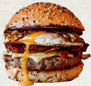
Burger with the lot 15.90

Beef patty, cheese, pickles, onion, grilled pineapple, fried egg, lettuce and tomato