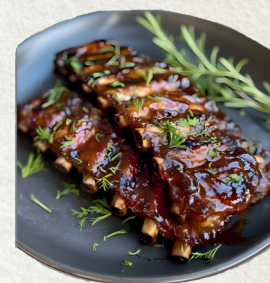
Beef Short Ribs 45.90

Veal coated with bread crumbs, Italian herbs, parmesan cheese, served with a choice of chips or mashed potatoes.