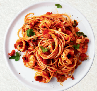
Chicken marsala 34.90

Spicy tomato sauce with garlic, chili and seared chicken strips cooked with penne.