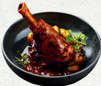
Lamb Shank 35.90

500g T-bone steak, served with a choice of chips or mashed potatoes.