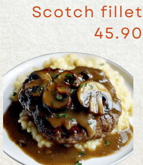
Scotch fillet 45.90

Grilled chicken breast topped with creamy mushroom sauce, fresh herbs, served with mashed potatoes.