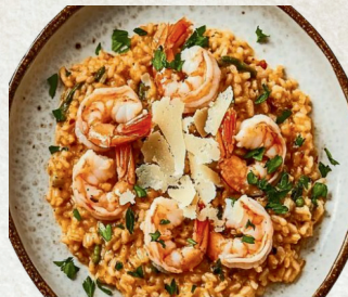
Chili prawn risotto 29.90

Chicken, mushroom, parsley, garlic, basil, creamy pink sauce, parmesan cheese.