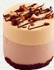
Cheesecake MARZBAR 14.90