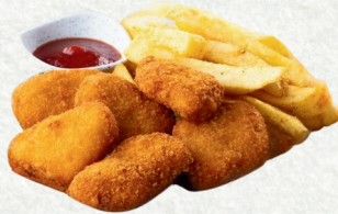
Chicken Nuggets with Chips 12.00

6 Chicken nuggets with chips and sauce of choice.