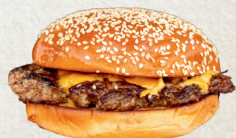
Smashed Cheeseburger 10.00

Roasted vegetables smashed coated with panko crumbed, cheese, lettuce, tomato and peri peri sauce