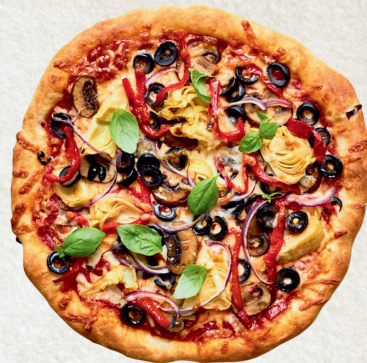
The True Vegetarian ✓ 21.90

Pepperoni, ham, mushroom, capsicum, oregano, mozzarella cheese.