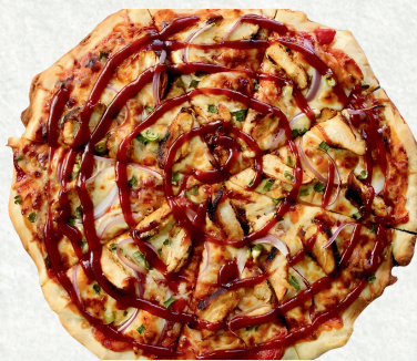
Barbeque Chicken Pizza 21.90

Marinated chicken, roasted capsicum, onion, cherry tomato, fresh herbs, mozzarella cheese topped with home made peri sauce.