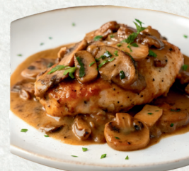
Chicken Fungi 35.90

Chicken breast fillet coated with Japanese panko crumbs, Italian herbs, topped with napolitana sauce, mozzarella cheese, and parmesan.