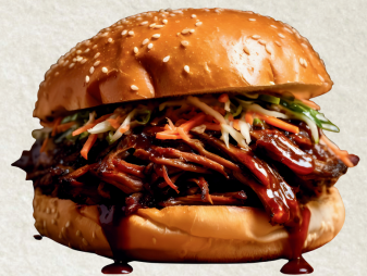
Pulled Beef Burger 15.90

2 x Beef patties, double cheese, lettuce, tomato, onion