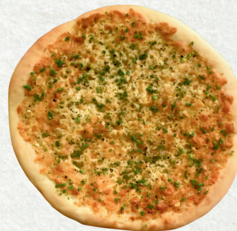
Cheese garlic pizza 14.90

Marinated chicken, mushroom, oregano, olive, roasted capsicum, onion and mozzarella.